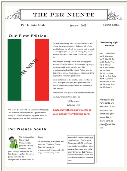
First Issue January 1, 2005