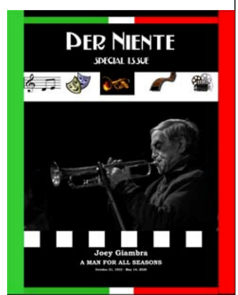
Special Issue 2020